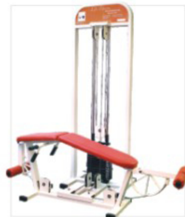
LEG CURL THIGH EXTENSION ◀ ML 253