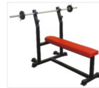
BENCH PRESS BENCH ◀ B 142