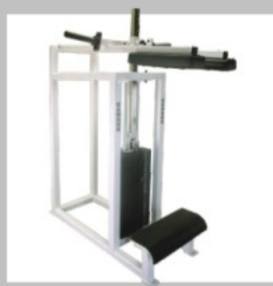
STANDING CALF ◀ ML 231