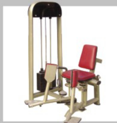
INNER THIGH ◀ ML 193