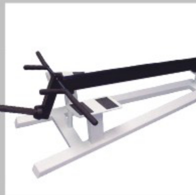
T - BAR ◀ BB 231