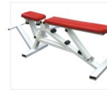
SUPER BENCH ◀ B 501