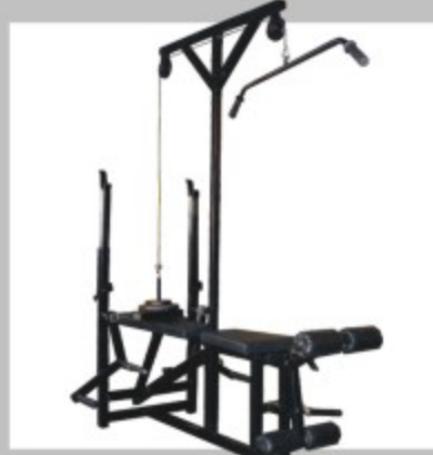
7 IN 1 BENCH ◀ B 13