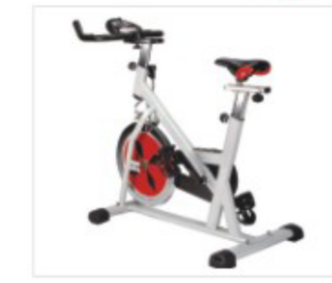
CYCLE ◀ H 301