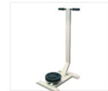
STANDING TWISTER ◀ BB 321