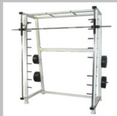
SMITH MACHINE ◀ MM 262