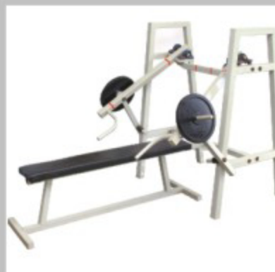
DUAL AXIS BENCH PRESS ◀ D - 1