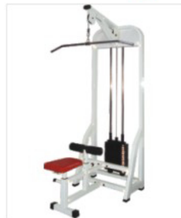
LAT PULLEY ◀ MU 103