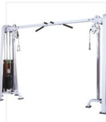
CABLE CROSS OVER ◀ MM 272