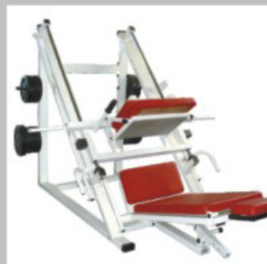
45° LEG PRESS & SCOT ◀ CO 302