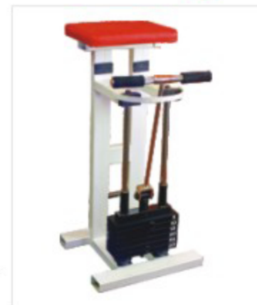
WRIST CONDITIONER ◀ MA 113