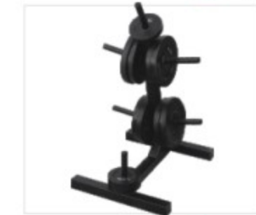
WEIGHT PLATE RACK ◀ S 201