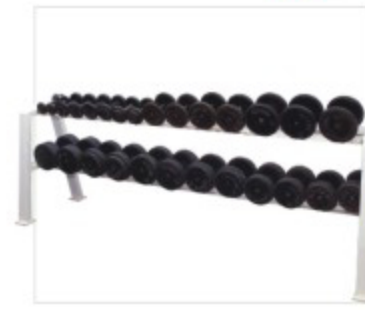
DUMBBELLS RACK ◀ S 101