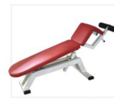
ABDOMINAL BOARD ◀ BB 171