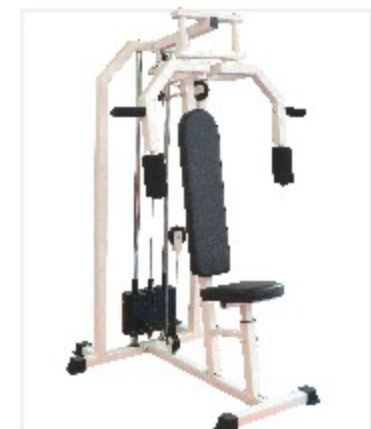
PECK - DECK ◀ MC 403