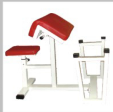
PREACHER CURL ◀ MA 102