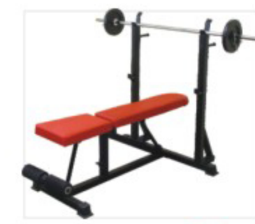
ADJUSTABLE BENCH ◀ B 602