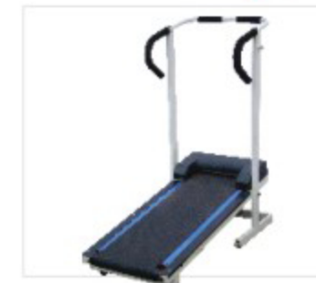
MANUAL WALKER ◀ H 701