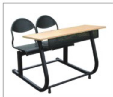
SCHOOL / COLLEGE BENCH ◀◀