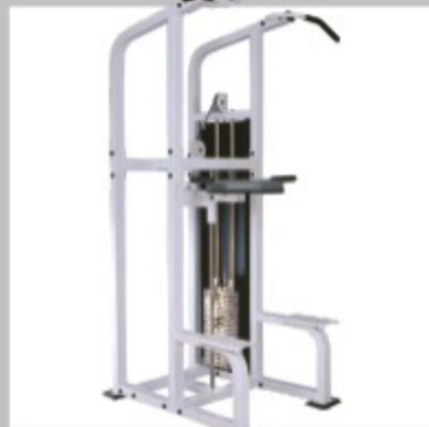
ASSISTED CHIN - DIP ◀ MV 292