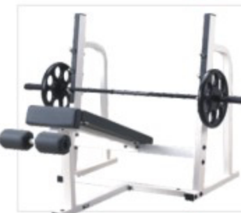
DECLINE BENCH ◀ D 701