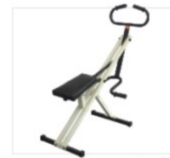
BODY JACK ◀ B 291