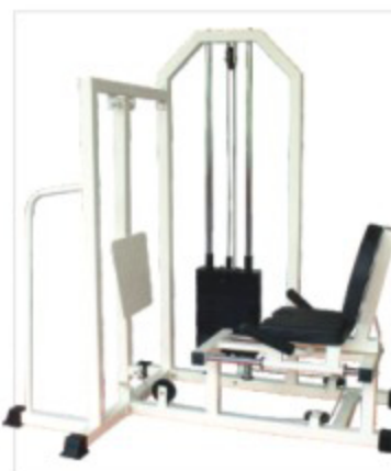
HORIZONTAL LEG PRESS ◀ ML 172