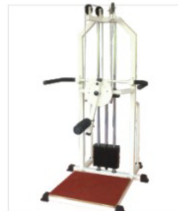
TOTAL HIP ◀ ML 182