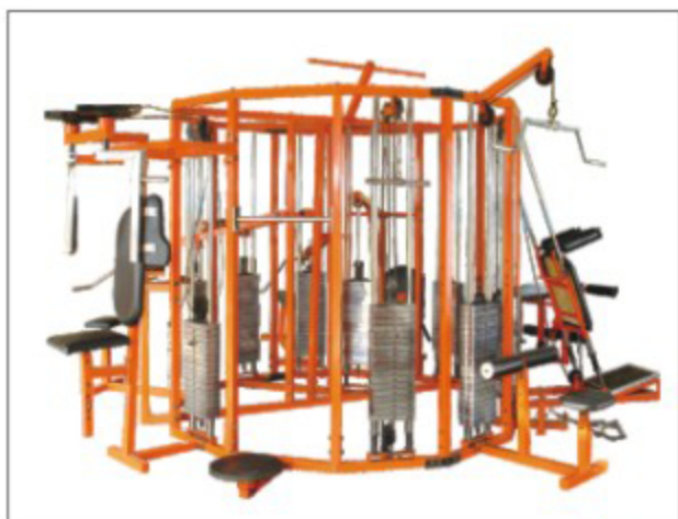
5 STATION MULTI GYM ◀ MM 202