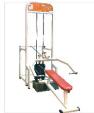
BENCH / SHOULDER PRESS ◀ MC 703