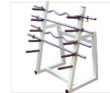
BARBELL RACK ◀ S 301